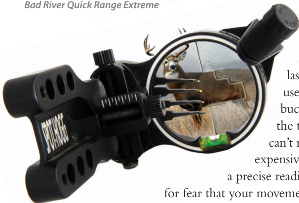
Bad River Quick Range