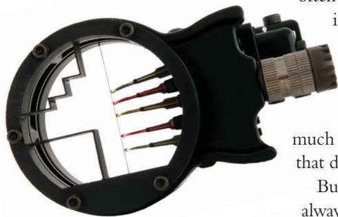
Bad River Quick Range Extreme

That's how the Quick Range operates. It's ridiculously easy. Now, before you too rapidly dismiss the Quick Range as some low-tech gimmick, stop and think a minute. The Quick Range works. The more you use it, the better you get with it. If you can't afford a laser rangefinder, the low-cost Quick Range is light years ahead of simply trying to guess the distance. And even if you have taken the plunge and laid down a pile of dollars for a laser rangefinder, the easy-to-use Quick Range is still a smart idea as a supplement to that high-tech wonder tool. In fact, the innocuous Quick Range will allow you to cover those bases a laser rangefinder just can't. Use your laser